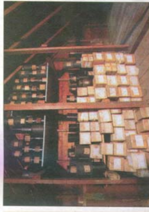
Cremains stored in various funeral homes throughout New Jersey.